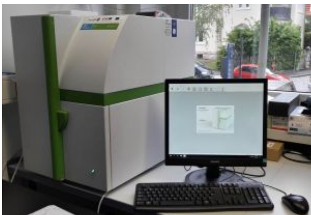
MicroBeta 2 with 12 detectors

Szintillation- and luminescenzce reader PerkinElmer