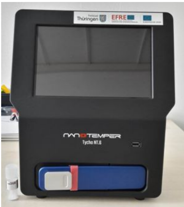
NanoTemper Tycho NT.6 for the quality control of proteins

This project is funded by the Free State of Thuringia with means of the European Regional Development Fund.