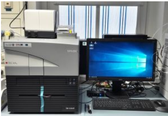
Platereader Tecan SPARK

SPR-based biophysical screening system PALL